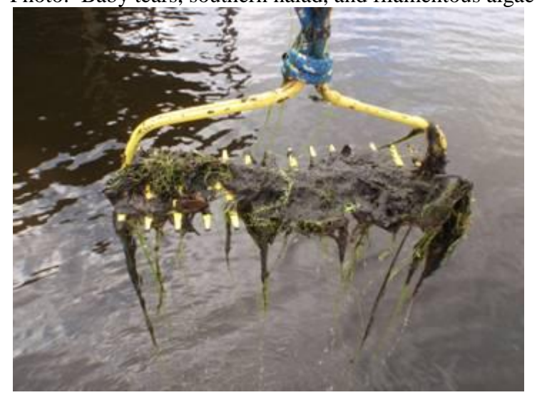
Photo: Baby tears, southern naiad, and filamentous algae collected from lake.

The recent drought and low water condition appears to be impacting the planted native emergent aquatic plants. During inspection, canna overall was performing the best as it has a higher drought tolerance than pickerelweed or duck potato. Lake Management Program recommends taking advantage of the low water conditions and replanting now. Planting just above the current water line will ensure enough water for establishment of the new plants and provide the right location for when the water rises again. Below you will find a figure illustrating the water fluctuations in your lake over the past 2 years.